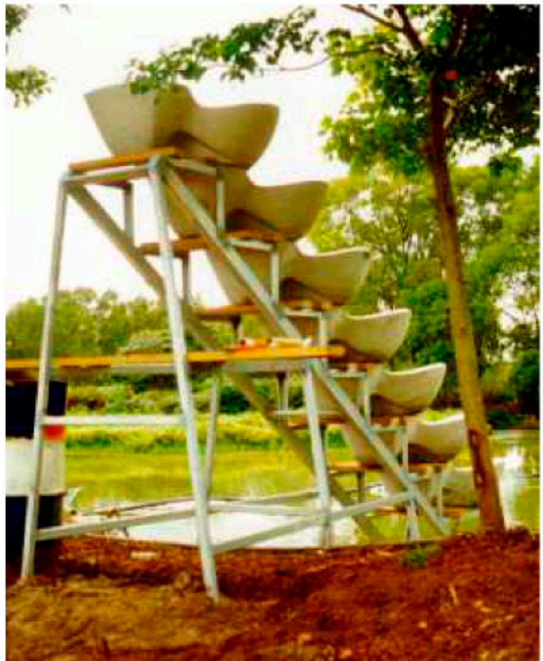
Vortex 7 Concrete Kit

The "Vortex", one of the latest Flowforms designed by the master Flowform creator, John Wilkes, is a large Flowform with a variable flow rate of 50-250Ltr/min. Its remarkable efficiency makes it our most popular Flowform kit.